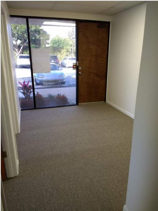
Alternate A1A is At Your Front Door

Location, Location, Location! This office is minutes from Jupiter Medical Center, Gardens Medical Center, I-95, and The Gardens Mall-PGA Blvd. Corridor. Palm Beach Gardens is famous for its lifestyle, great public & private schools, and welcome mat to businesses of all types. This office is perfect for a second location as well as a primary business address. Get the Palm Beach Gardens address for a very competitive rate.