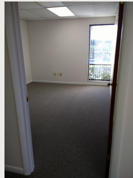
Ground Level Parking, new landscaping at the entrance

530 s/f Professional office with new air conditioning, carpet, vinyl flooring. Wood doors. Waiting area,, 2 private offices, bathroom, storage. All floor space has been maximized. $16.50 Base rent, , $6.65 CAM